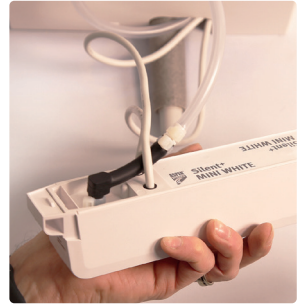
Easy to install. aspenpumps.com